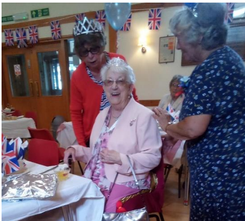
A happy member at Middlemarsh WI's Jubilee Party