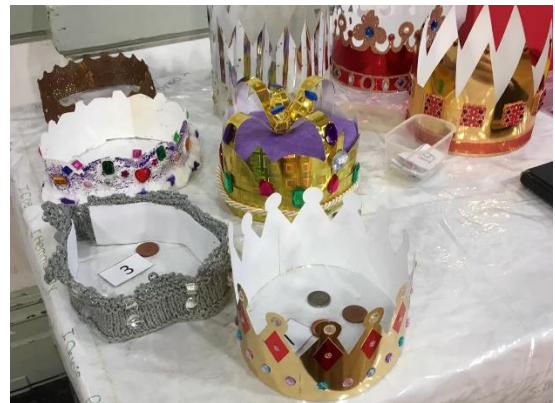
Herne WI held a crown making competition.

For more photos check out our Facebook Group at https://www.facebook.com/groups/194088150989832