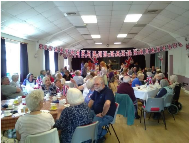
Lynsted with Teyham WI hosted a Coffee morning for the village

Below are just some of the photos that have been sent in or posted on Facebook showing how the Jubilee was celebrated by East Kent WIs.