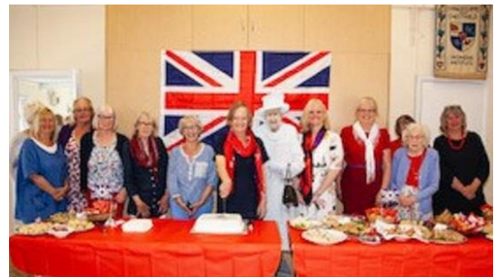
Chestfield WI welcomed a special guest!