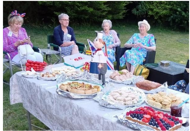
Sandwich WI enjoyed a delicious afternoon tea