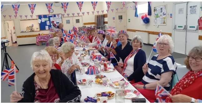
St Peters Village WI celebrating in style