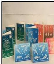
Lino cut cards