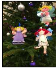
Christmas tree fairies & angels