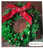
Jigsaw puzzle Christmas Wreaths