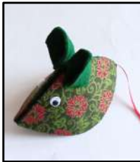
Christmas mouse to hold a little gift

Choose two crafts from those displayed, one for the morning and one for the afternoon. Details of any equipment required will be sent to those who have booked nearer the date.