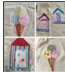
Appliqué tote bag Choice of design