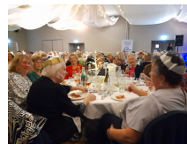
At the Mercury Hotel

Afterwards we warmed up with a cup of tea and mince pie. Collection raised £133 half will go to the church, the rest of the money to the local food bank, that we support every month.