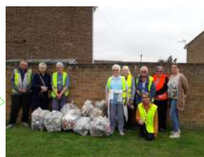
Lynsted with Teynham WI

With the weather on our side and finding aching muscles we didn't know we possessed, we were then treated to a well-deserved rest with tea, coffee and biscuits, at member Nicole Clarke's house, sitting out in her garden. Well done ladies.