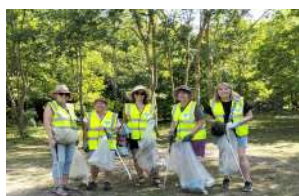
Tunstall Evening WI

Ten members from Churchill Sittingbourne took part in the Big Green Initiative on Saturday 14th and collected 10 Bags of Litter around Sittingbourne Town, not bad in just an hour and half. Members feedback was that they thoroughly enjoyed the morning and said that it was "quite addictive" and "therapeutic" !