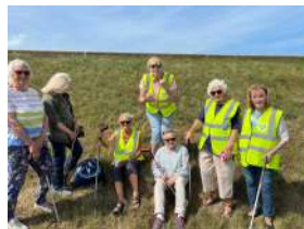
Seasalter and District WI

Seasalter and District WI did Our Beach Clean at Seasalter 13th June for The Big Green Week. Well Done ladies