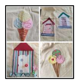
Appliqué tote bag Choice of design