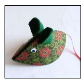
Christmas mouse to hold a little gift

Choose two crafts from those displayed, one for the morning and one for the afternoon. Details of any equipment required will be sent to those who have booked nearer the date.